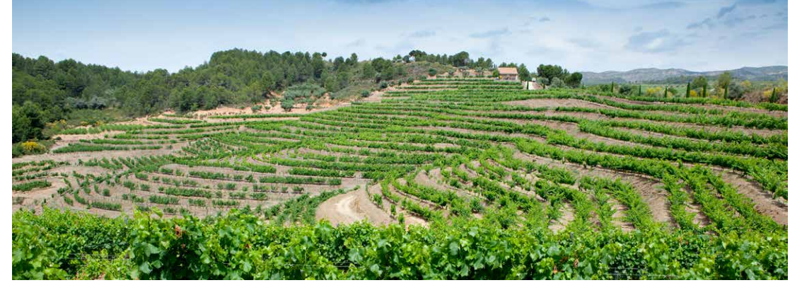
The Solanes del Molar estate banks in the DOQ Priorat.

Singular homelands that unite with a thousandyear-old tradition. Each of our winery's estates enjoys a unique climate and the particular edaphological and geological conditions that make every one of our wines stand out.