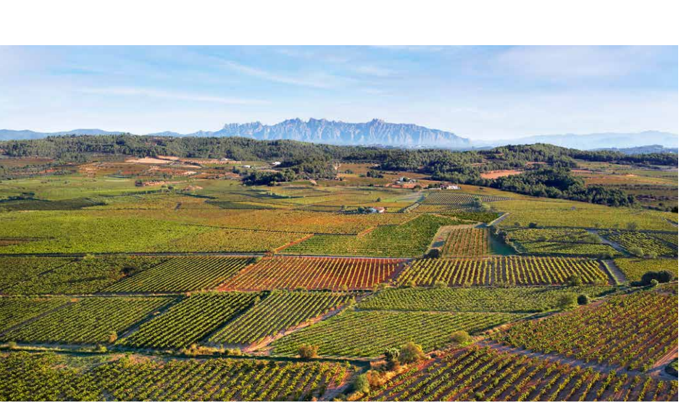
Panoramic view of the Teuleria dels Àlbers vineyards with a backdrop of the Montserrat range.

Our central headquarters is located in La Granada, a small town situated in the heart of Penedès, the historic wine area south of Barcelona. From here, we make an extensive range of cavas, which have brought international fame to the winery, reds with a marked Mediterranean character, and refreshing whites and rosés. The Massana family's 60 hectares of vineyards are located between La Granada (Teuleria dels Àlbers estate) and Subirats (Serra de Can Rovira estate) at different inclines, with soils and microclimates that allow us to cultivate an ample variety of grapes, both Mediterranean and Atlantic.