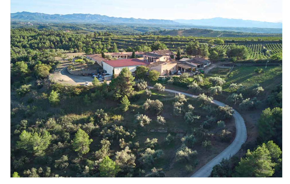
Aerial view of Mas dels Frares, the building surrounding our Priorat winery.